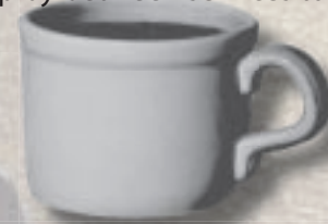
Discover Grace Coffee 10:45am Room A1

The Carnations on our stage represent the lives of those who have accepted Christ as their Savior through the outreach efforts of those at Grace.