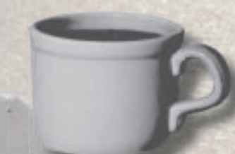
Discover Grace Coffee 10:45am Room A1

The Carnations on our stage represent the lives of those who have accepted Christ as their Savior through the outreach efforts of those at Grace.