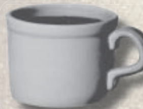
Discover Grace Coffee 10:45am Room A1

God is working in our midst and I am encouraged as I watch the staff and people of Grace respond with enthusiasm to His leading. I know God has heard our prayers and is revealing His will for our lives. I can see God's blessings already and sense He has much more in store for us. Get your hopes up for the future!