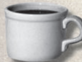
Discover Grace Coffee 10:45am, Room A1

The Carnations on our stage represent the lives of those who have recently accepted Christ as their Savior through the outreach efforts of those at Grace.