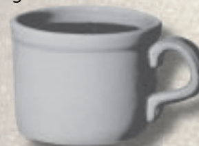
Discover Grace Coffee 10:45am, Room A1

If you are new to our church or the Christian faith, we would love to help you get connected to others who are moving in the same direction. Visit the Discover Grace Counter in the Lobby for more information or attend the Discover Grace Coffee held every Sunday at 10:45am in Room A1.