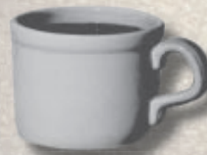
Discover Grace Coffee 10:45am, Room A1

The Carnations on our stage represent the lives of those who have recently accepted Christ as their Savior through the outreach efforts of those at Grace.