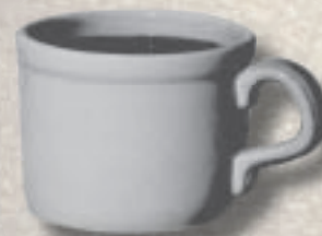
Discover Grace Coffee 10:45am, Room A1

The Carnations on our stage represent the lives of those who have recently accepted Christ as their Savior through the outreach efforts of those at Grace.