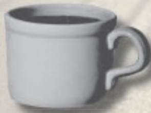
Discover Grace Coffee 10:45am, Room A1

Grace and how you can get connected, stop by the Discover Grace Table in the Lobby. Members of our family serve there between services and would love to meet you and answer your questions. I'd like to meet you too... stop by the Discover Grace Coffee held every Sunday at 10:45am in Room A1.